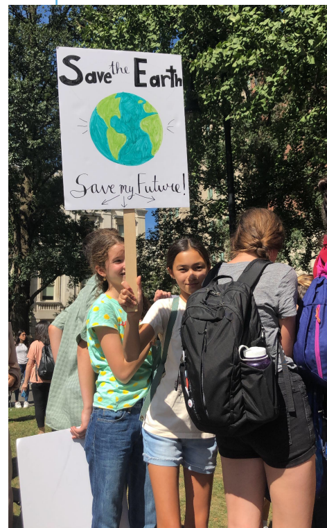
"Save the Earth, Save my Future"