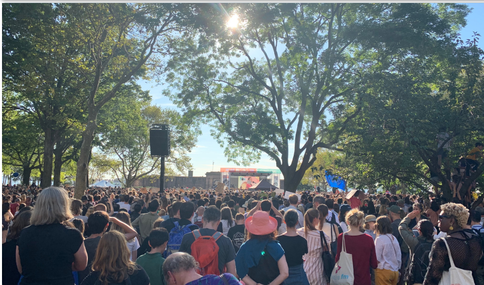
Global Climate Strike, NYC